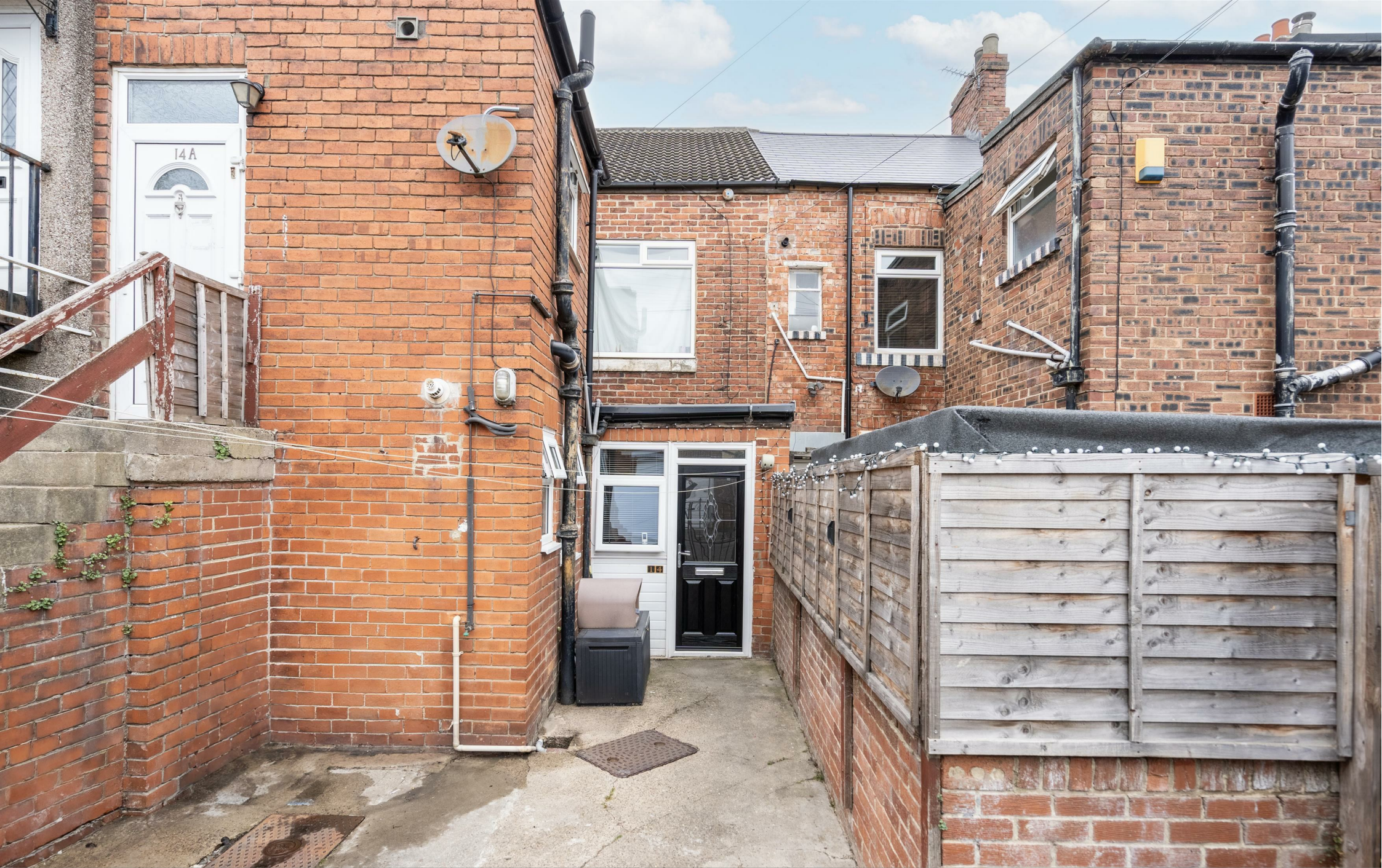
📍 Ann Street, Newcastle Upon Tyne NE27 0QR